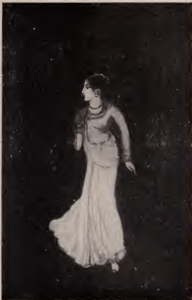
"ABHISARIKA," BY ABANINDRA NATH TAGORE (MODERN).